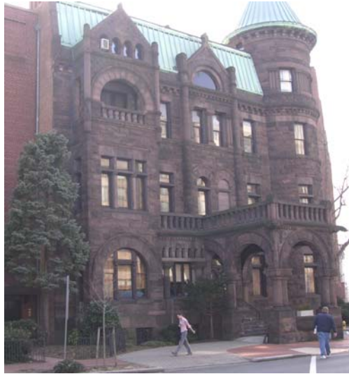
Christian Heurich Memorial Mansion